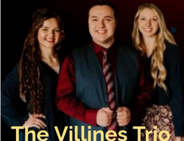
The Villines Trio